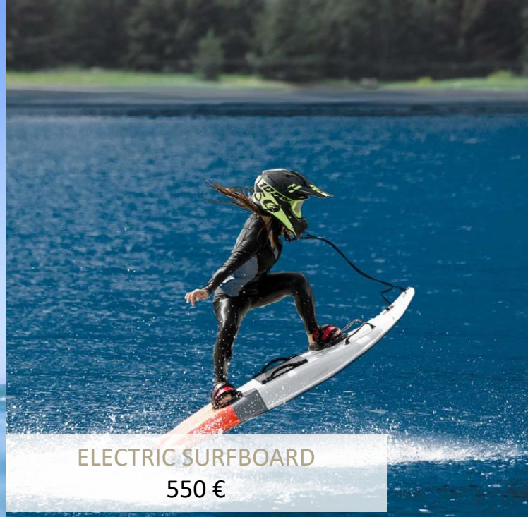
ELECTRIC SURFBOARD 550 €