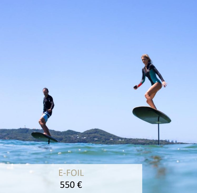
E-FOIL 550 €