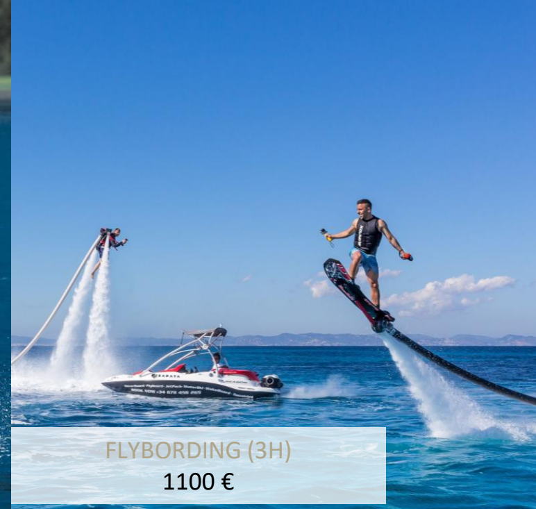
FLYBORDING (3H) 1100 €