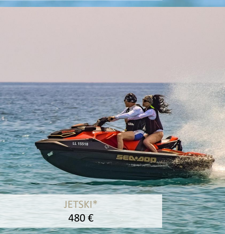
JETSKI* 480 €