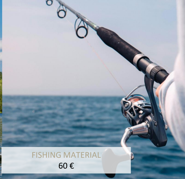
FISHING MATERIAL 60 €