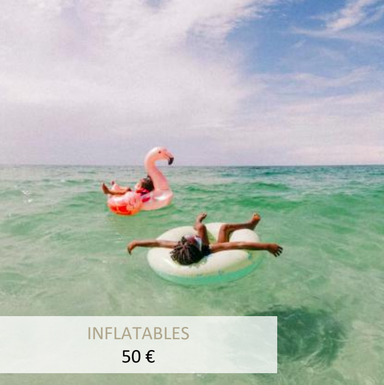
INFLATABLES 50 €