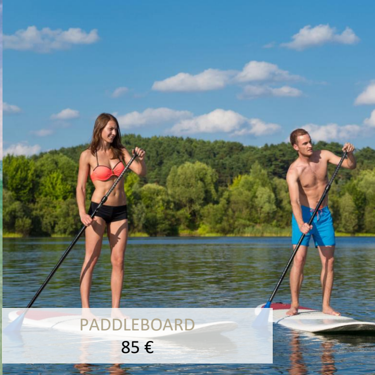
PADDLEBOARD 85 €