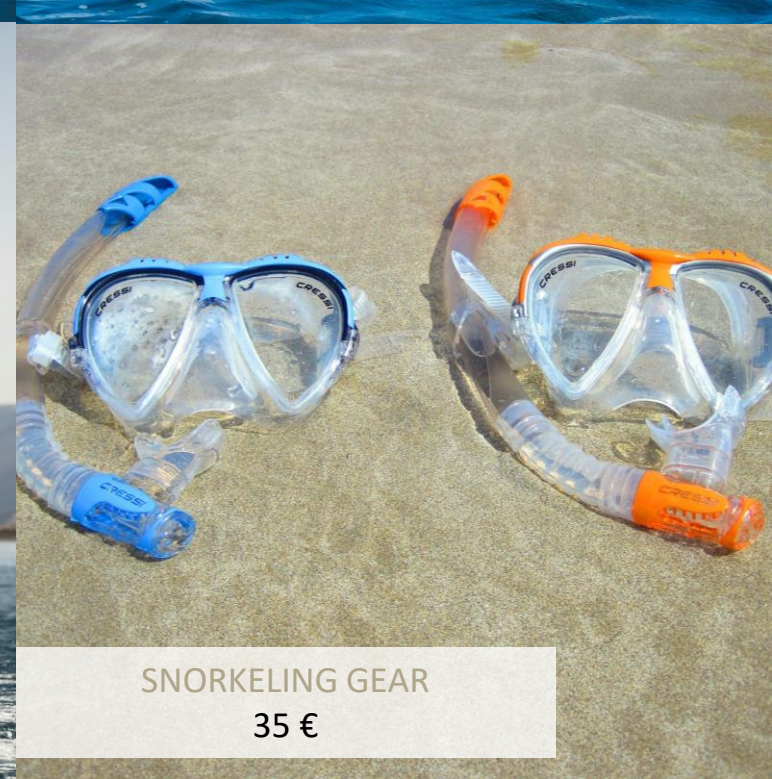
SNORKELING GEAR 35 €